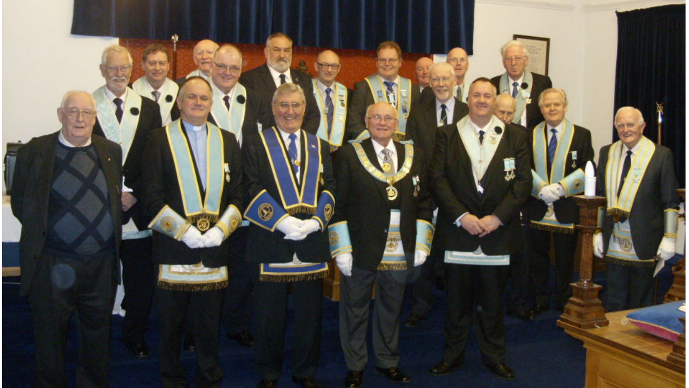
Above The PGM with members and guests after the memorial service.